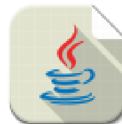
4: Computational thinking