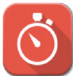
6: Resource management