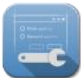
1: System design