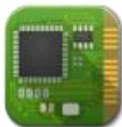
2: Computer Organisation