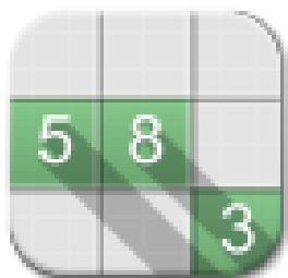
5: Abstract data structures